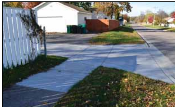
The City of Crystal has identified and will remove sidewalks not connected to a larger sidewalk system on one or both ends.

The analysis also included a proposal to add sidewalk along W. Broadway Ave. in the Broadway Park area, which is the only county highway segment in Crystal without sidewalks on both sides of the road.